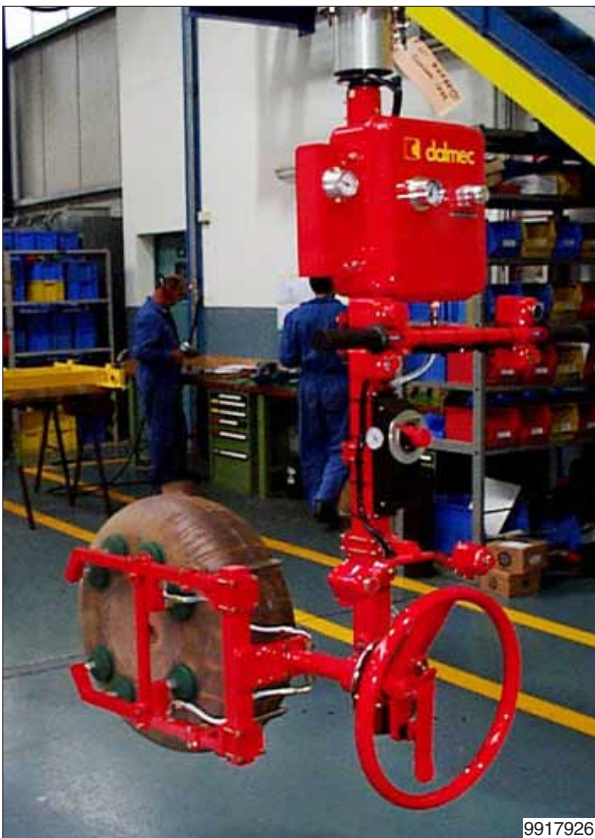
Manipulator with suction cup tooling (Venturi) for gripping and manual rotation of tanks.