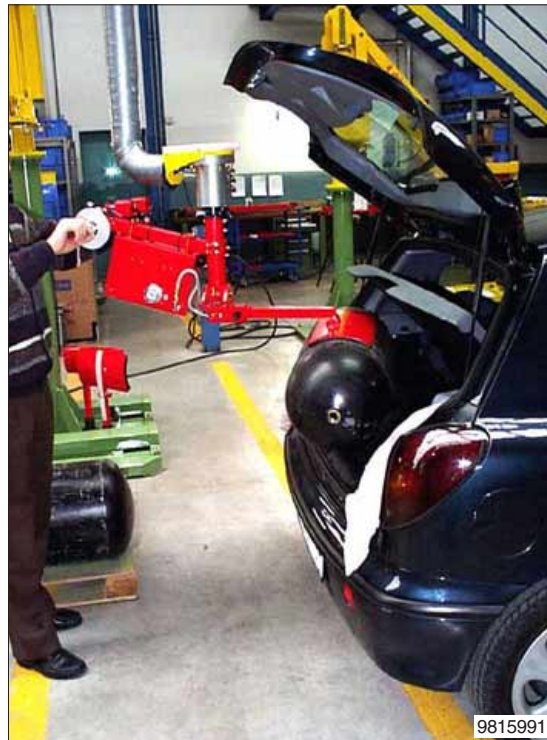
Manipulator with adjustable suction cups tooling (Venturi) for gripping and handling tanks.