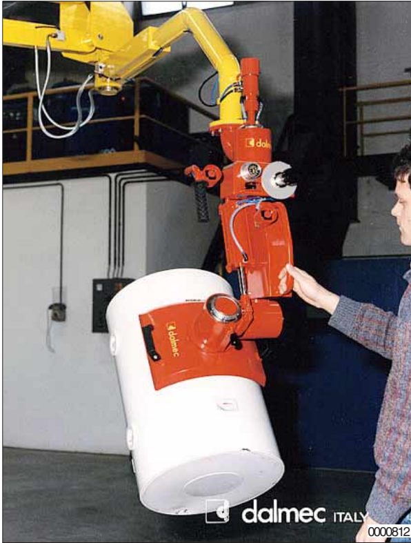
Partner PRC column mounted Manipulator, with suction cup tooling (Venturi) for gripping and manual rotation of boilers.