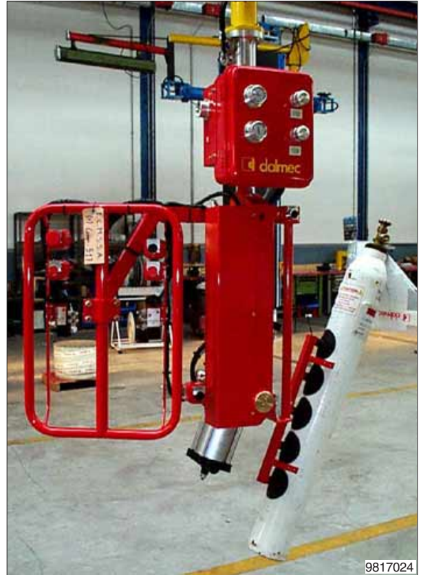
Manipulator with suction cup tooling (Venturi) for gripping and inclination of cylinders