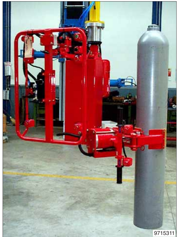
Manipulator with pneumatic tooling for gripping and inclination of cylinders having different dimensions.