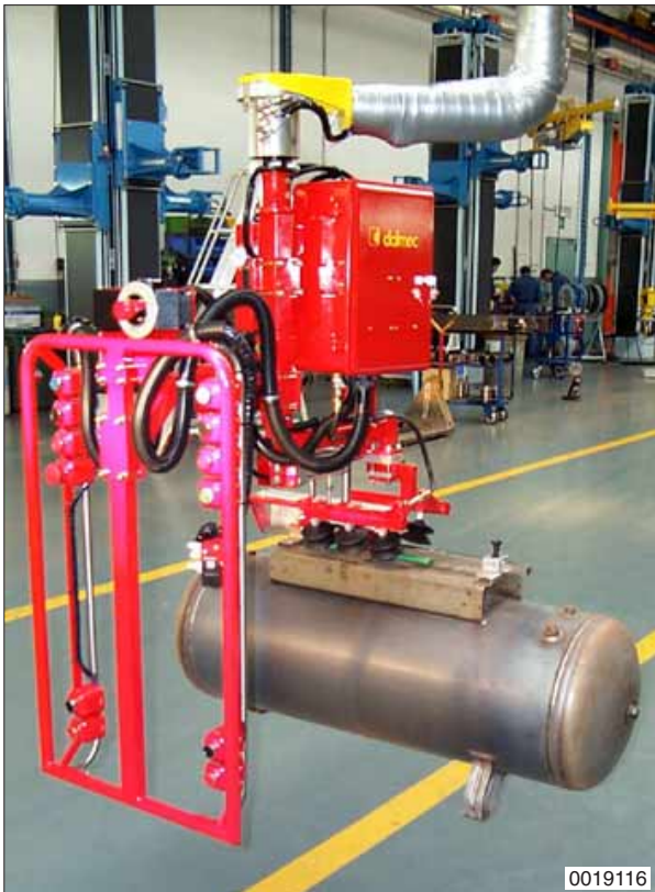
Manipulator with suction cups tooling (Venturi) for gripping and handling of tanks.