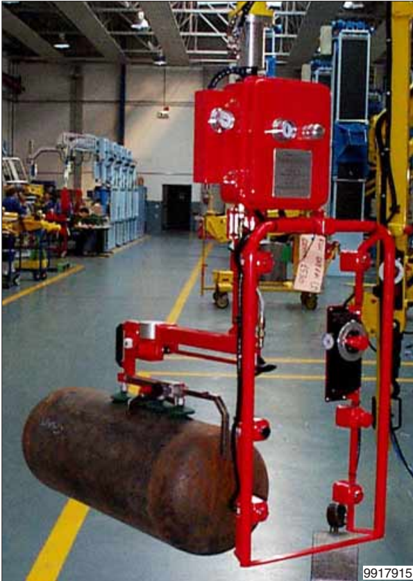
Manipulator with suction cup tooling (Venturi) for gripping and manual rotation of tanks.