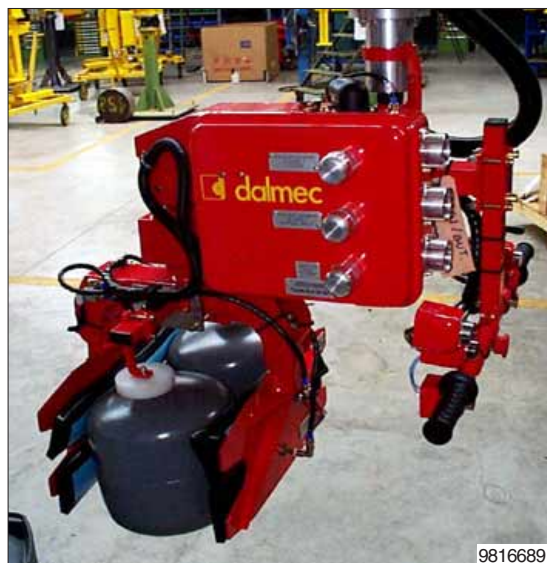
Manipulator with pneumatic tooling for gripping and inclination of cylinders having different dimensions.